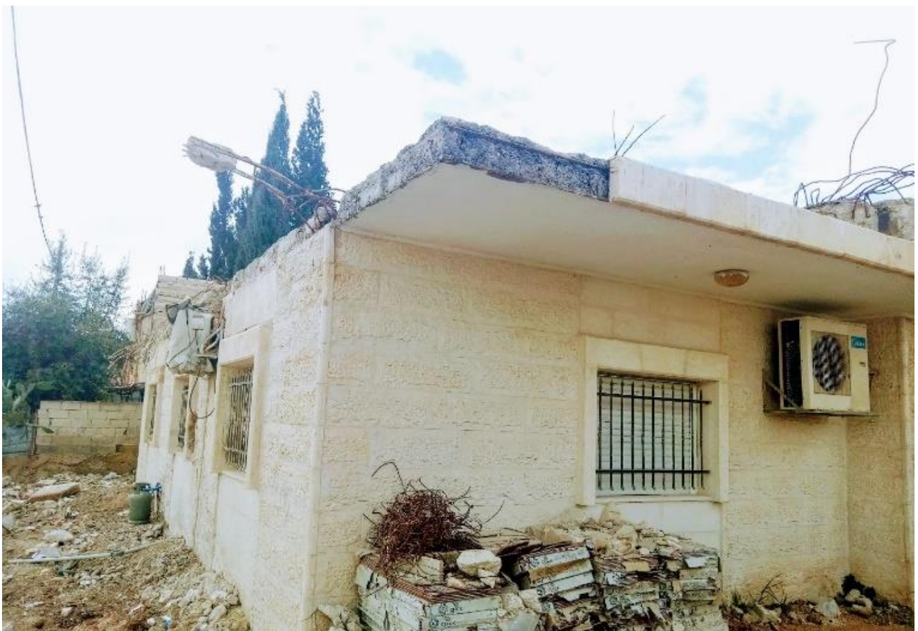
A house that was partially demolished in Issawiyeh, JLAC® (2020)

Due to Israel's discriminatory and exclusionary planning policies, thousands of Issawiyeh's rapidly growing population, which nears 20,000, have had to build without permit and thus face the constant risk of home demolitions. Over the past decade, the Israeli occupation municipality has demolished or forced the demolition of 124 structures, resulting in the displacement of 66 Palestinians. So far in 2021, Israel has demolished 19 structures in Issawiyeh, including seven residential homes. While all of these demolitions are conducted under the pretext of acting against "illegal construction," one of them also had a punitive undertone. On 22 February 2021, Israeli bulldozers, backed by special police units, raided Issawiyeh to demolish a building containing four residential apartments owned by the