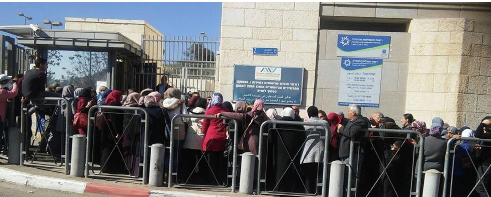
Tens of Palestinians are waiting in front of the offices of the Israeli Ministry of Interior in East Jerusalem