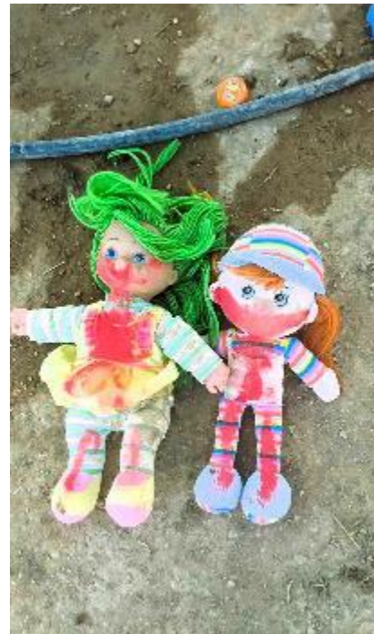
Dolls covered in blood at the entrance of the Arab Al-Kaabna School

cleansing. JCHR urge the international community to urgently address these violations, reaffirm the significance of international law, and advocate for a resolution that respects the rights and dignity for Palestinians.