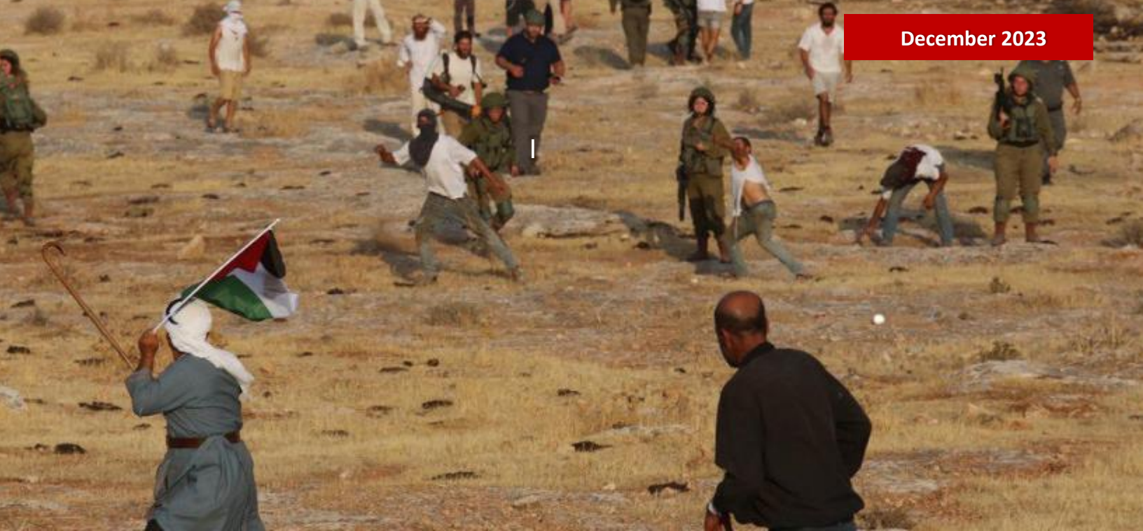
Under the protection of soldiers, settlers throw rocks at elderly Palestinians near the Teyaseer, Tubas.