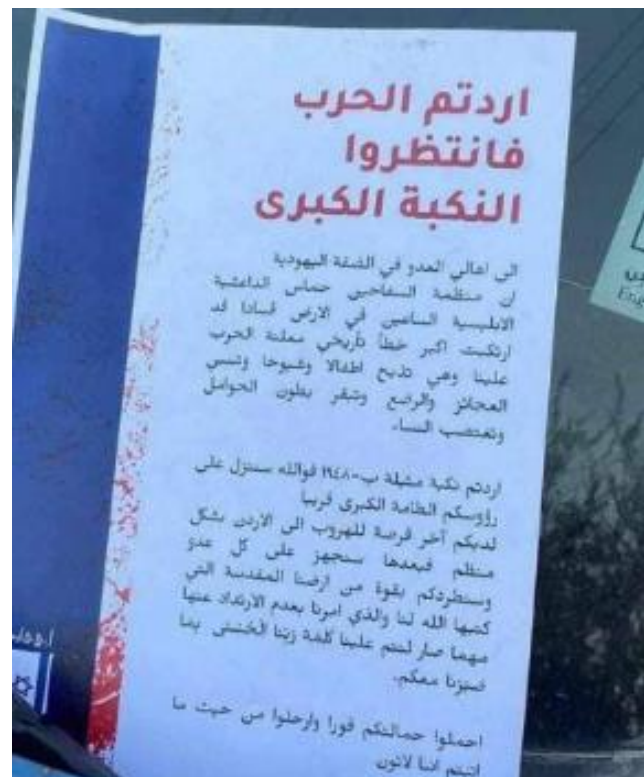
A leaflet that warns Palestinians of a new “major Nakba”

The order also noted that trees and shrubbery are to be cleared as to allow for the land’s use as a “vantage point” if needed militarily. The settlement’s existing area being at a higher elevation to the land in